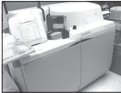
Closed system (above) weighs 750 pounds. Under the hood (right), test tubes move through for analysis. The machine performs up to 400 laboratory tests per hour.